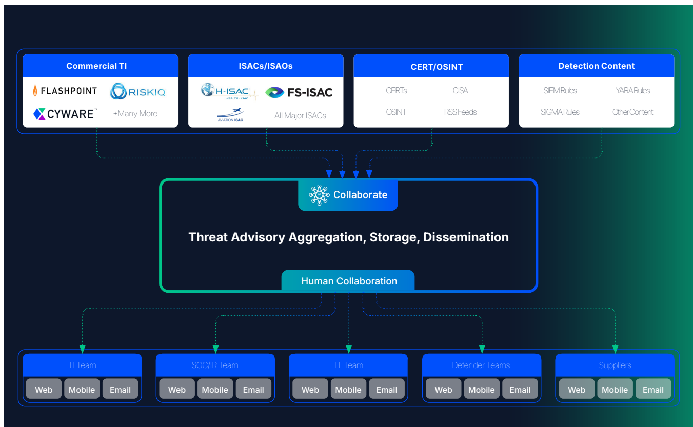
Fig 2. Cyware Collaborate Architecture Diagram