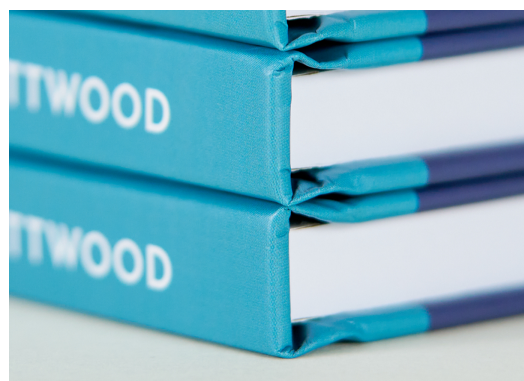
Printed cover wrapped over rigid board

It is advised to keep text 5mm away from the outer edges and 10mm away from the spine to ensure it remains fully visible inside the cased cover.