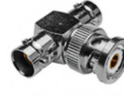
Adapters page 22