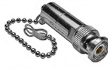
Terminators page 21