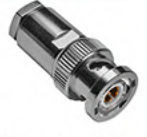
Connectors page 24-25