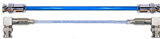
Cable Assemblies pages 15-20