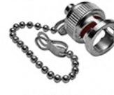
RFI Caps page 21