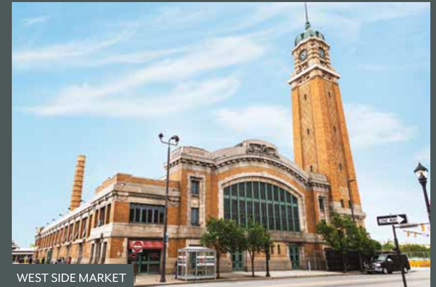
WEST SIDE MARKET

Located just west of downtown in Ohio City is Cleveland's famed West Side Market, home to more than 100 vendors and boutique shops. The European-style market offers something for everyone, including hand-cut meats, seafood, fruits and vegetables, Old World baked goods, fresh flowers, ready-to-eat foods, local clothiers, handmade jewelry, home décor and specialty gift items.