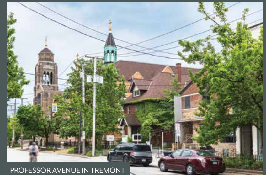
PROFESSOR AVENUE IN TREMONT

One of Cleveland's oldest neighborhoods, Tremont features dozens of unique restaurants and award-winning chefs, like Michael Symon, Zack Bruell and Dante Boccuzzi. The district has been dubbed Cleveland's foodie's paradise and adds to the charm of the tree-lined streets and 18th-century homes. The community is also a hub for artists, as centuries-old art adorns public spaces adjacent to contemporary murals.