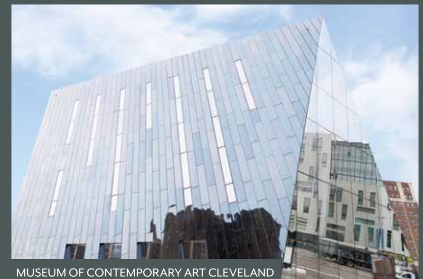
MUSEUM OF CONTEMPORARY ART CLEVELAND

Cleveland's rich arts and culture scene is on full display in University Circle. It boasts world-class museums, historic universities and libraries, nationally recognized medical facilities and beautiful parks. Whether you're visiting the Museum of Contemporary Art Cleveland or grabbing a window seat at an eclectic eatery, "the Circle" offers a diverse social scene and unique atmosphere for everyone.